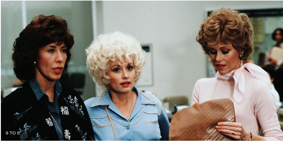
9 TO 5