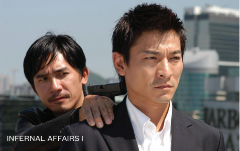
INFERNAL AFFAIRS I

EYES WIDE SHUT (1999) 12/25 - 12/28 Stanley Kubrick's dark comedy of sex and secrets, starring Tom Cruise and Nicole Kidman, garnered mixed reviews upon release, but in the decades since, it has become recognized as a modern classic.