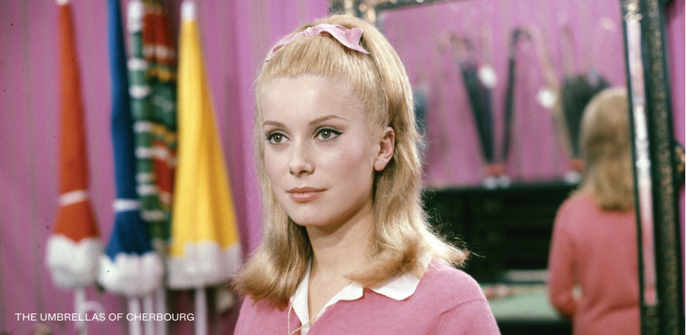
THE UMBRELLAS OF CHERBOURG

THE FLOWERS OF SHANGHAI (1998) 12/8 - 12/11 Four men pursue courtesans and opium amongst the "Flower Houses" of Shanghai. Tony Leung (IN THE MOOD FOR LOVE) stars in director Hou Hsiao-hsien's look at the quiet decadence and cruelty of a vanished era.