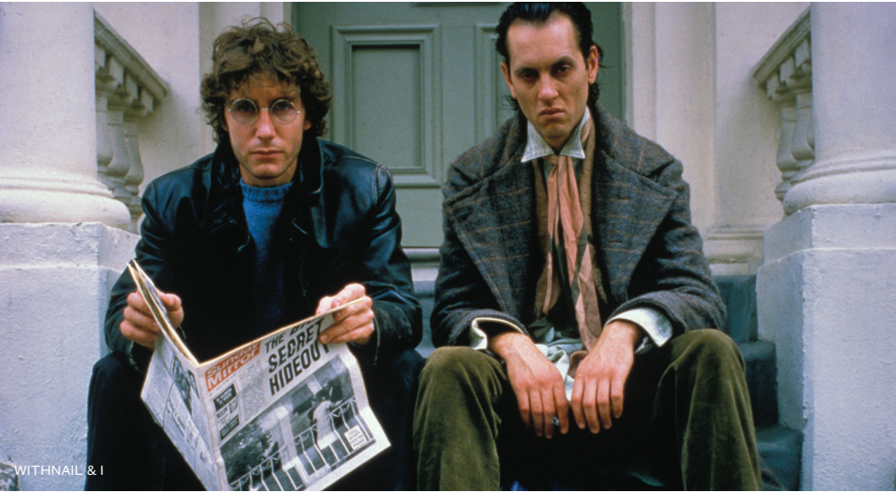
WITHNAIL & I